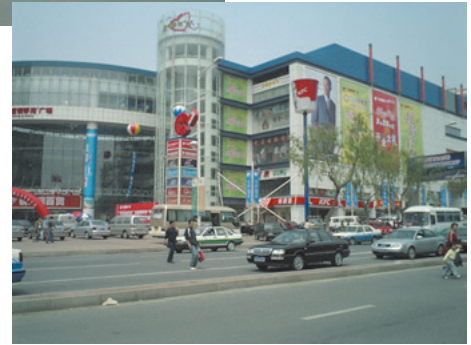
Development zone central area

Furthermore, there is a beautiful scenic spot called Jishitan, which was designated as a resort area by the Central Government. Its beaches are very popular in the summer, when the area is lit up until 9 o'clock at night and there are many attractions, and many people gather here even on weekdays.