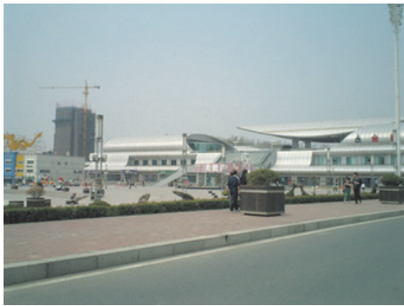
Development zone train station

This zone is located 27 km northeast of the center of Dalian across the Dalian Gulf. The area was previously an agriculture and fishing village. Development of the area started in 1984, when it was designated by the Central Government as a development zone (first zone to be so designated). Since that time, many Japanese manufacturing companies have established operations in this zone. Currently there are over 260 companies there, and the number of residents has swelled to 280 000. In recent years, companies from Korea and other countries have also established operations there. Trains connecting the center of Dalian, this development zone, and Jinshi began operating. It is now possible to commute to this develop zone from the city in 30 minutes, which many people are doing.